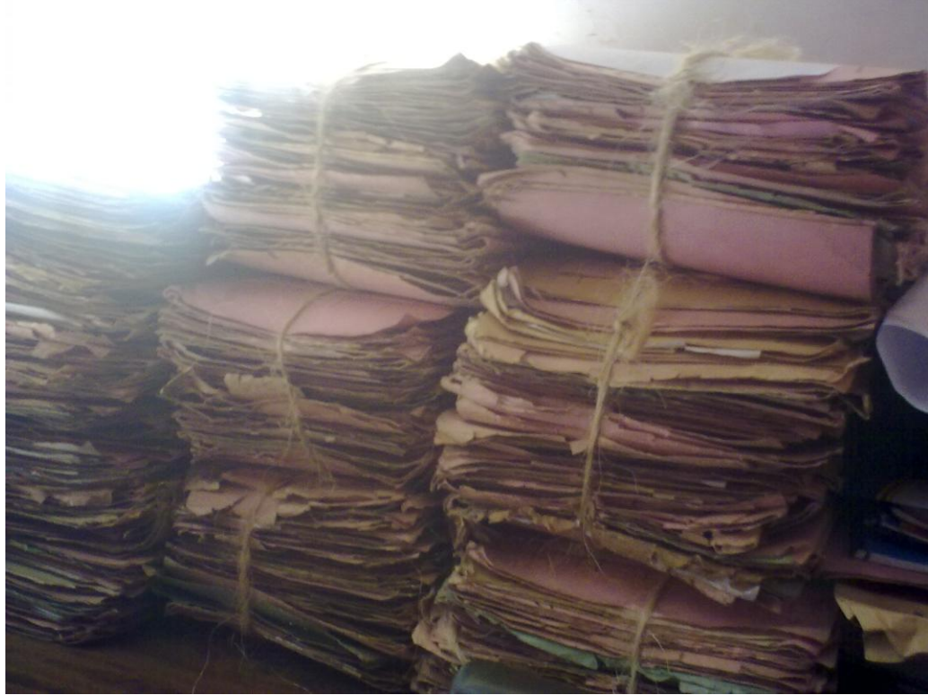
Picture 2: Verified and Assessed pension files pending payment, taken on 15 th October 2009

Delay to access pension affects the retired officers' livelihood thereby making them frustrated and some of them not accessing pension in their lifetime.